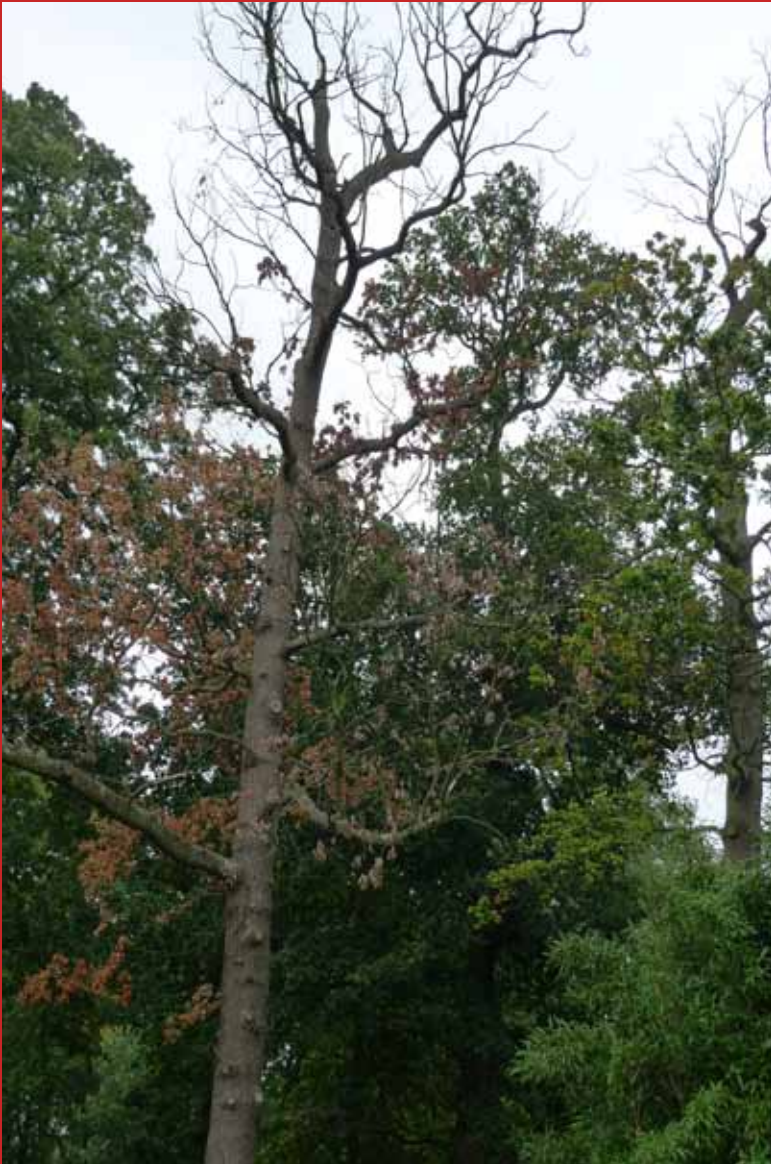
Oak showing symptoms of Acute Oak Decline with staining from bleeding and decline of canopy.