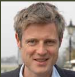
Zac Goldsmith, MP for Richmond Park and North Kingston